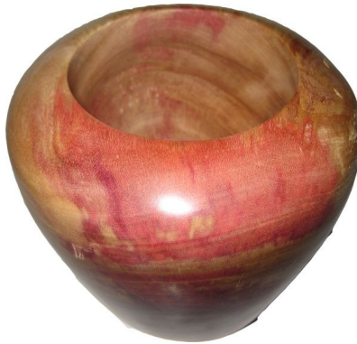
pink stains prefer no soil or vermiculite

Shavings / soil conclusion: helpful for spalting, but not for the reasons most people think