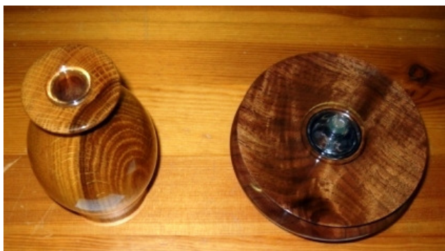
Nick Matos-Vase-Oak- 21 coats w/o poly