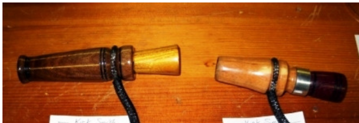
Kirk Smith-Duck Call- Walnut & Osage Orange- Poly