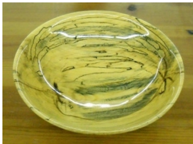
Nick Matos-Bowl-Spalted Hackberry- 31 coats w/o poly- weighs 5 oz