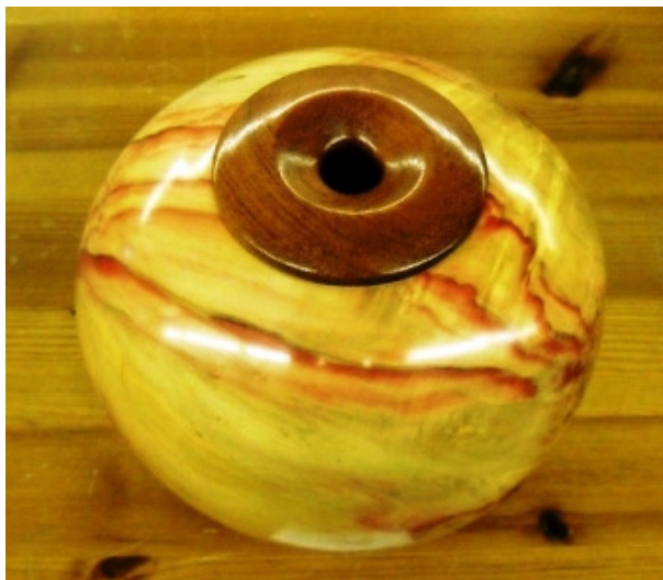
Norm Fowler-Hollow Form-Box Elder