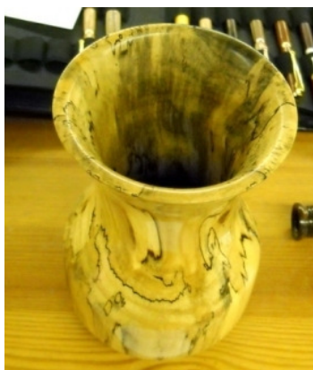
Kirk Smith-Vase-Spalted Hackberry-Poly